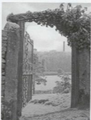
Photograph of the Recreation Ground through the Arched Gateway

The plans are to upgrade the Civic Hall so that as many people as possible will want to use it regularly, and to fix rents at a level that will ensure maximum use. The Council is still exploring ways of managing the Civic Hall on behalf of the